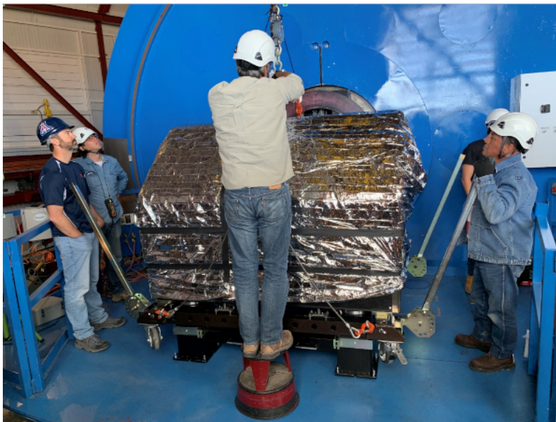
Adjusting the load spreader for the cart.