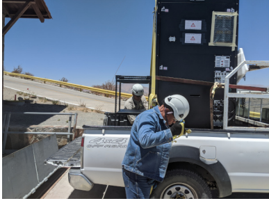
The rack on a truck for transport.