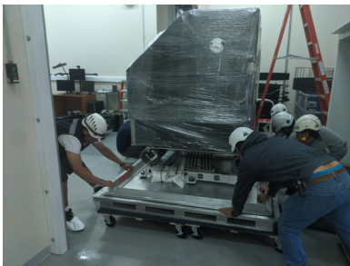
Moving the instrument on the pallet into the cleanroom temporarily