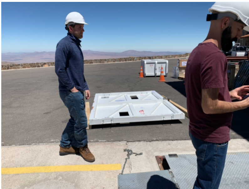
The front panel temporarily stored outside