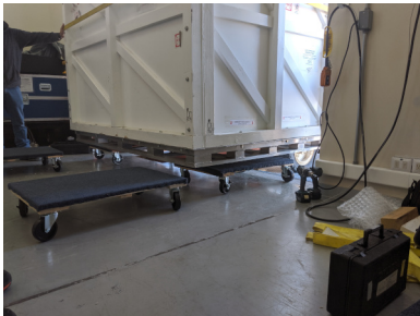
Using the forklift to set the box down on 4 furniture dollies

Note: Use caution when first driving on to the pentlift as the lift will settle under the weight.