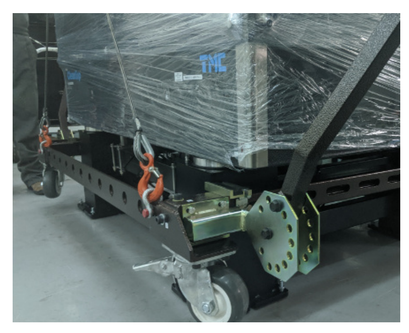
Hooks must open up on the cart to get the correct length.

• Lift the instrument+cart, which weigh 1920 lbs , until all 4 wheels are off the ground. If it is out of balance, it will be necessary to manually correct.