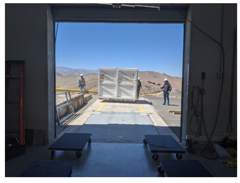
The instrument box is brought to the unpacking area with the forklift.

• Move the empty box and shipping frame into the unpacking room with the forklift, placing it on 4 furniture dollies.